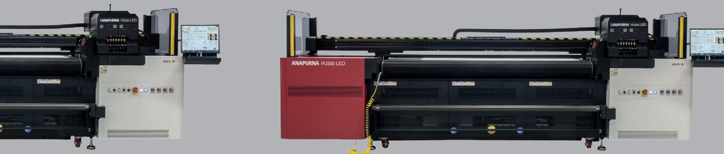
> Anapurna H2500i LED