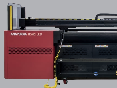
> Anapurna H2050i LED