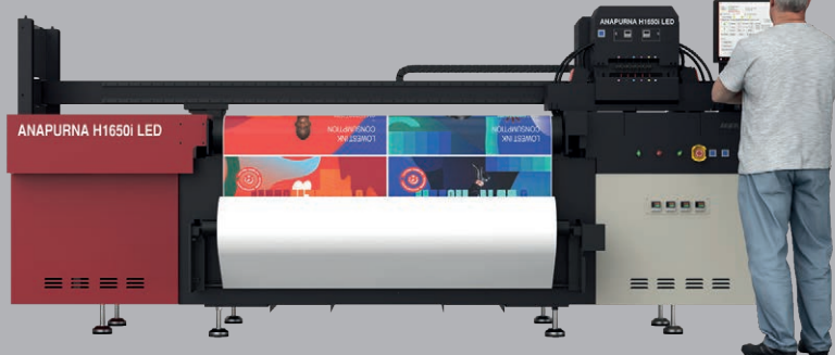
> Anapurna H1650i LED

The use of specialty inks and the little heat generated by the LED array passing over the substrate allows you to print on a wider range of materials. As a result, the engines can print on thin heat-sensitive styrene as well as everything from foils and laminates to coated paper, PET, fluted polypropylene, soft foam boards, or industrial film.